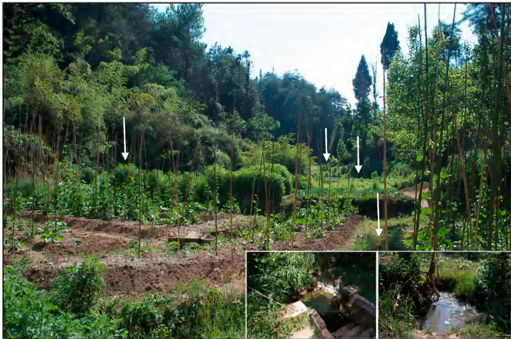
Fig. 2. Habitat in which Tylotriton yangi was found at the type locality of Gejiu. Examples of typical breeding pools are shown at the right corner (from left to right, PBP#17 and PBP#12), and positions of other pools are indicated by white arrows.

on both June 5 th and June 6 th . Pre-spermatophore deposition courtship behavior patterns were recorded using the same equipment as in the first trial. After the observation sessions, all adults were released back to the wild.